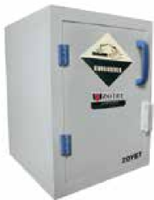
(1) PP, Single Door, 15Lit.