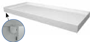
(3) Spare PP Shelf (4 Hooks included)