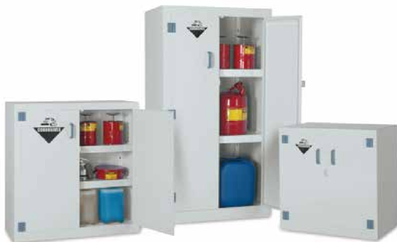
Polypropylene (PP) Safety Cabinets for Acid & Corrosives